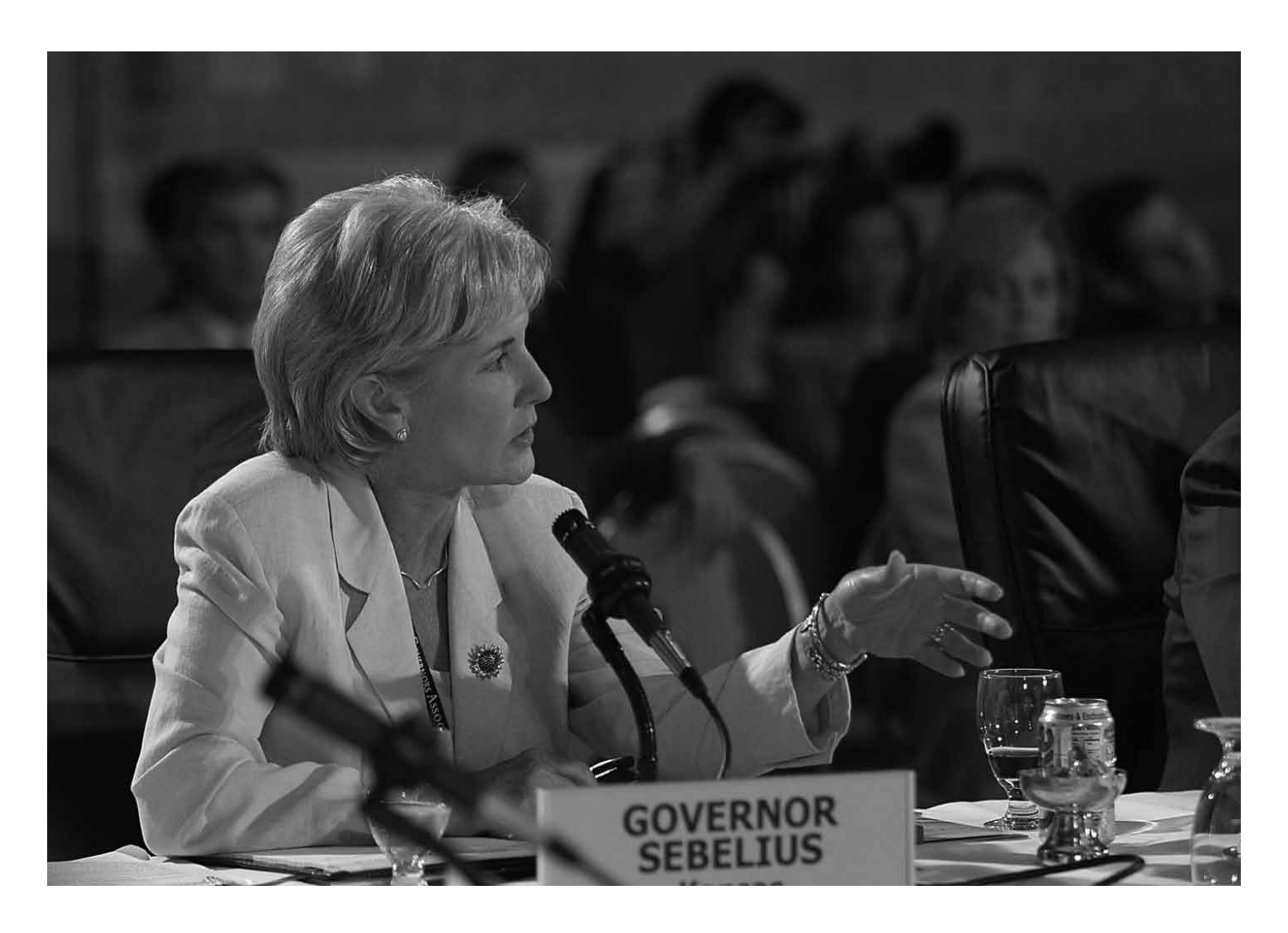
As a popular Democratic governor in a Republican state, Sebelius became a prominent national figure. She served as the first female chair of the Democratic Governors Association in 2007, delivered the Democratic response to President George W. Bush's State of the Union in 2008, and was on Barack Obama's "short list" for vice-president.

Her first term in office was marked by the key issues of balancing the budget and funding education.<sup>3</sup> In 2005, Governor Sebelius helped broker a successful compromise on education funding after calling for a special legislative session following the state supreme court's order that the legislature increase school funding by $285 million or risk shutting school