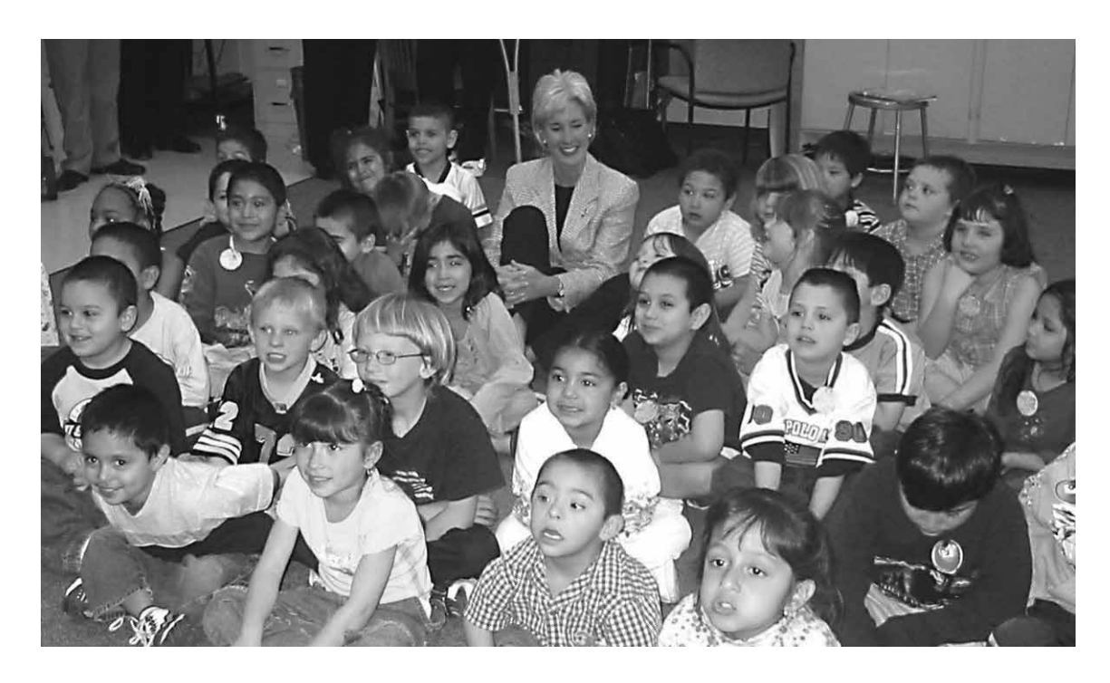
Governor Sebelius' first term in office was marked by the key issues of balancing the budget and funding education. In 2005, following the state Supreme Court's order that the legislature increase school funding or risk shutting schoolhouse doors, the governor helped broker a compromise during a special legislative session. "I was raised in a family valuing education," said Sebelius, who posed for this photograph at Topeka's Lowman Hill Elementary School. "I found it really welcoming that in Kansas, voters, regardless of their party affiliation, felt public school funding was fundamental."